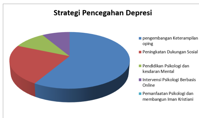
Figure 2. Data on Depression Prevention Strategy