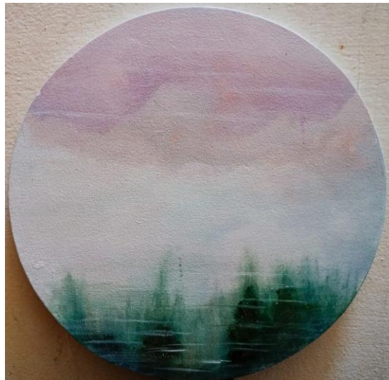
Figure 2. The portrait reflects clouds, sky, and trees as afterthoughts with specific meanings

The second portrait, related to the expression and reflection of my inner feelings and emotions, is also presented as a piece of art portrayed as afterthoughts. The second portrait is the following: