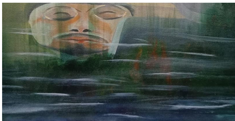
Figure 3. The portrait with my reflection in it represents my afterthoughts symbolically

Like the other two paintings, this portrait expresses my imagination and afterthoughts, including some touch of feelings and emotions. The portrait depicts my reflection in the deep water. My self-reflection in the portrait is presented symbolically because the reflection of my face in the deep water is not my face but my afterthoughts on the canvas. The depth of the water is the depth of my thoughts in which I remain busy almost always. This depth also expresses the deep and long process of my thinking and imagination about the reality of various things in this world. From the portrait, it can be observed that the reflection in the water is not static but dynamic.