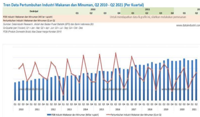
Figure 2. Food and Beverage Industry Growth Data Trends from 2010 to 2021

In total, the trend data on the growth of the food and beverage industry each year from 2010 to 2021 can be seen in Figure 2. Companies in the food and beverage sub-sector also have bright prospects in the future. This is because the need for food and drink in everyday life is excellent. Business people see this as an opportunity to provide or fulfill market needs. Consumer loyalty will be created if the market is interested in the products produced. This condition will increase profits for the company.